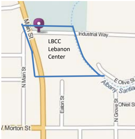
Lebanon Center 44 Industrial Way, Lebanon

Health Occupations Center 300 Mullins Dr., Lebanon