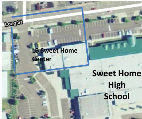
Sweet Home Center – in Sweet Home High School