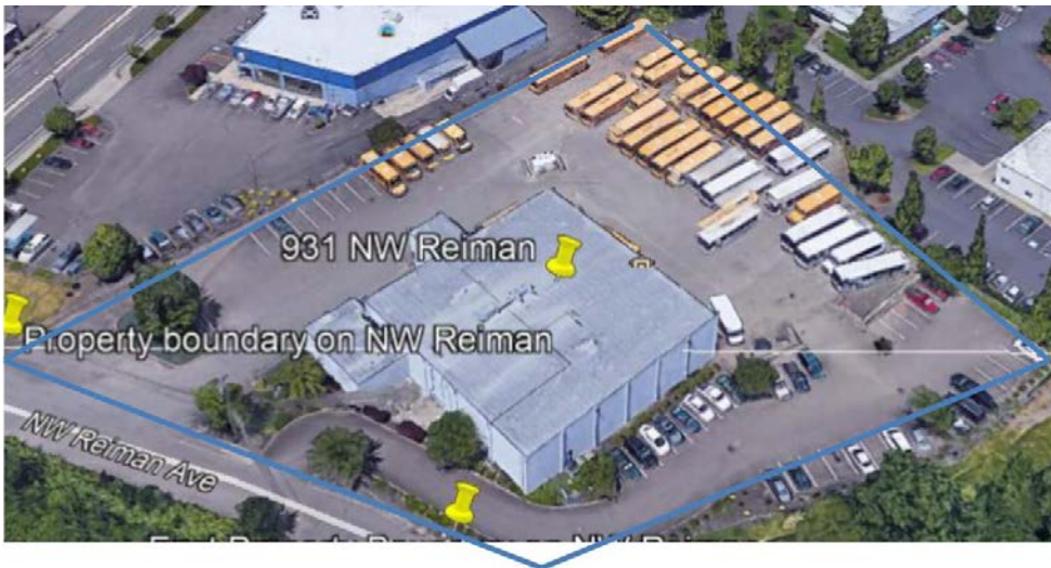
Benton Center North – 931 NW Reiman