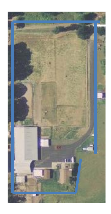
Horse Center - 2258 SW 53rd