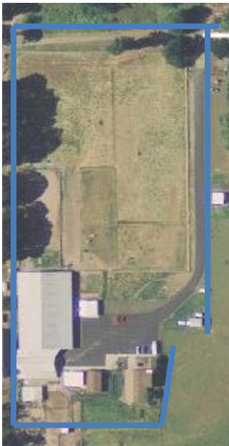
Horse Center – 2258 SW 53rd