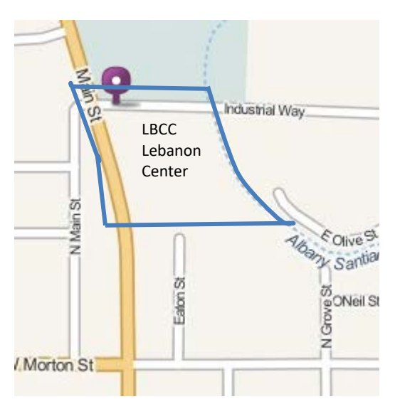
Lebanon Center 44 Industrial Way, Lebanon